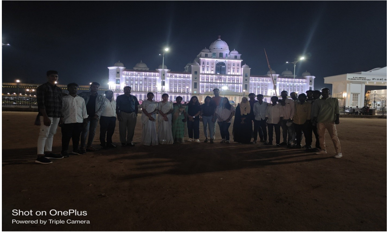
Shot on OnePlus Powered by Triple Camera