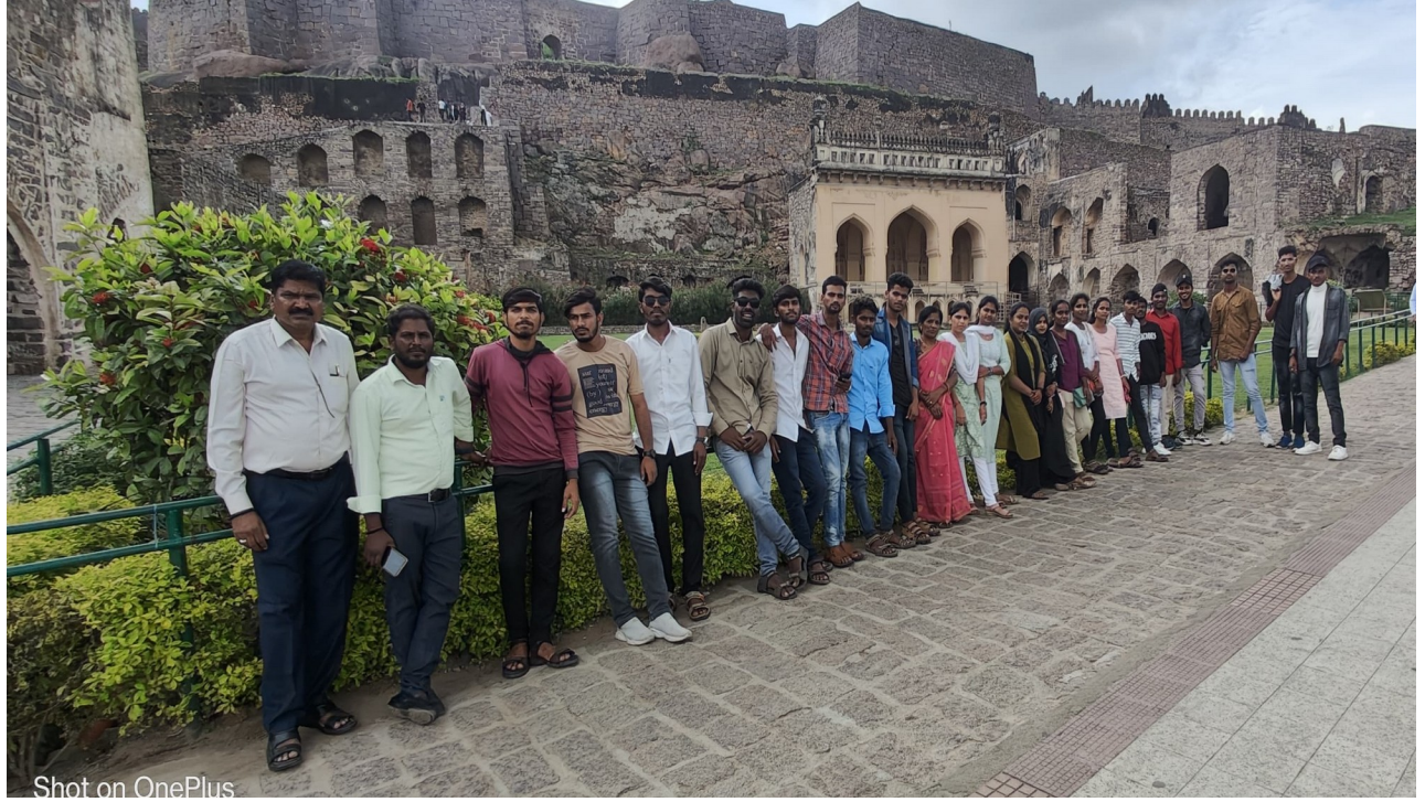
At Golconda Fort Hyderabad