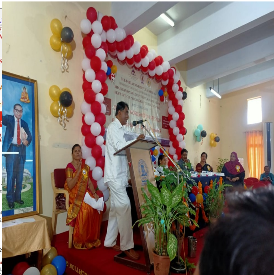
KBN University, Kalaburagi