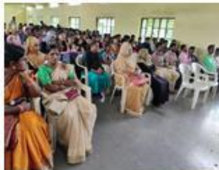
Participated Faculty and Students